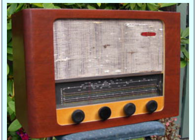
PYE Model PZ77. In going order. Available for sale at our forthcoming meeting.

* The Christchurch West Radio Club Rooms are in Auburn Park, which can be accessed through a walkway at 333 Riccarton Road almost opposite the National Bank. Follow the pathway around to the right and that will take you right to it! The park can also be accessed off Auburn Avenue, which runs off Middleton Road.